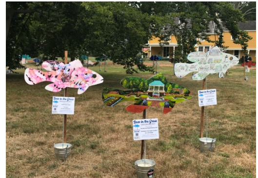
Here's a photo from our fun "Bass in the Grass" event at Hale Farm last year